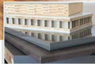
Adhesive systems for furniture elements, LVT design floors and sandwich elements